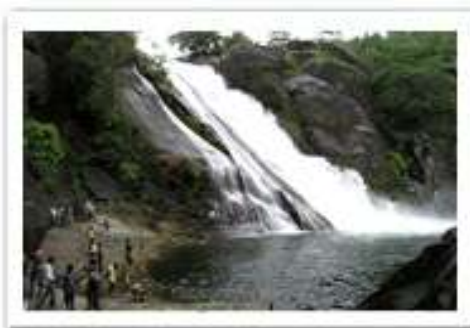
CHIDAMBARAM – NATARAJAR