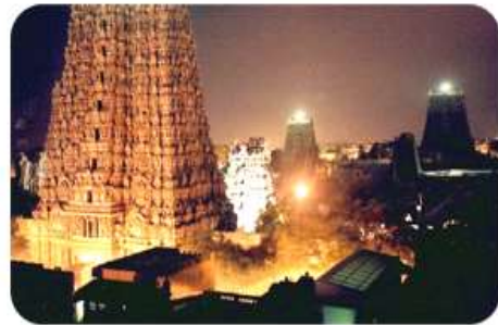
KANNIYAKUMARI (CAPE COMORIN)