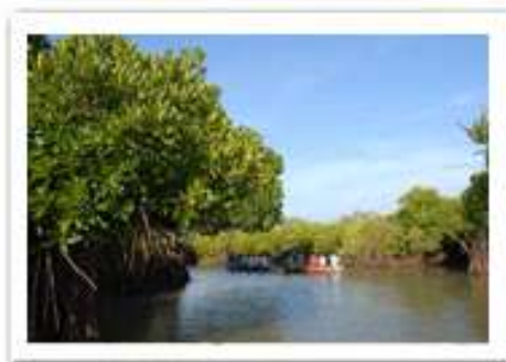
CHENNAI -MARINA BEACH