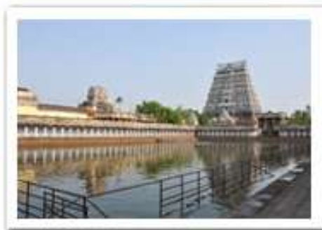
A GLIMPSE OF TAMIL