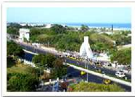
NADU TOURIST PLACES